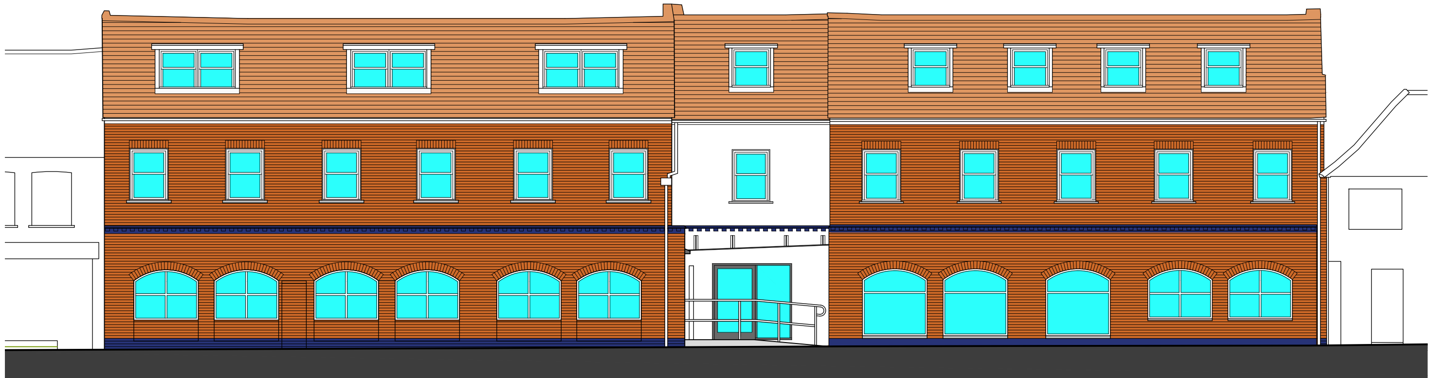
ENTRANCE / EXIT